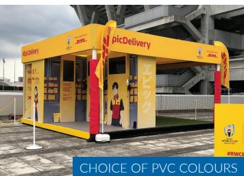
CHOICE OF PVC COLOURS