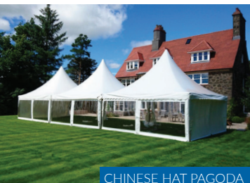
CHINESE HAT PAGODA