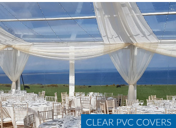
CLEAR PVC COVERS

Discover the wide range of services we have on offer below. Not only do we supply Höcker compatible clearspan structures, but we can also provide covers and accessories for existing structures that can be customised to meet your needs.