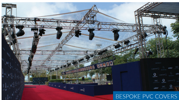
BESPOKE PVC COVERS